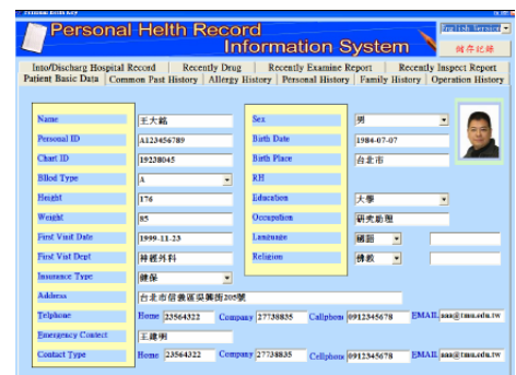
A TET Implementation (Sample screenshot)

TET Project Website: http://www.medinfo.org.tw/TET